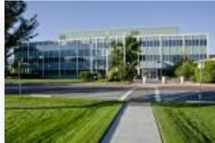
Idaho Transportation Department Headquarters Building Boise, Idaho