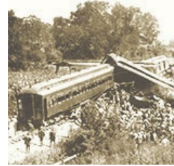
Investigations of Railroad Accidents 1911 - 1993